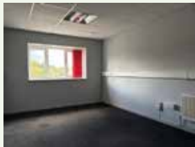
First Floor Office 1