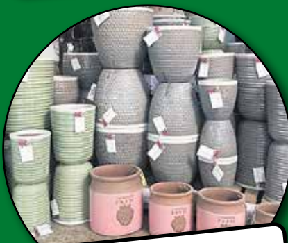
Large selection of Ceramic Pots