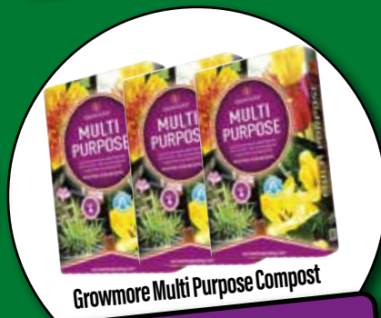
Growmore Multi Purpose Compost