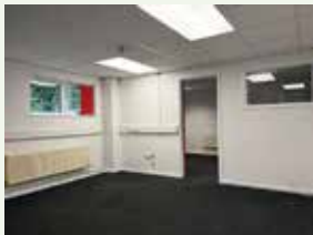
Ground Floor Office