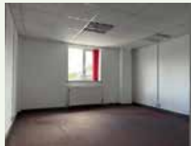
First Floor Office 2