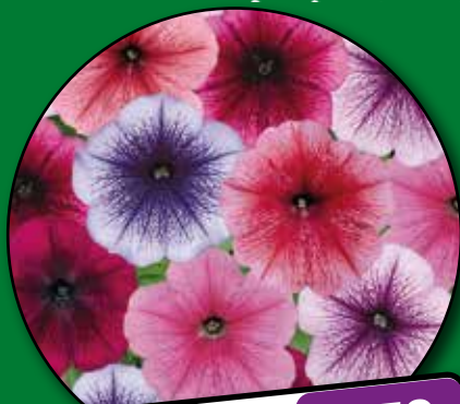
Bedding Plants 20 PLANTS