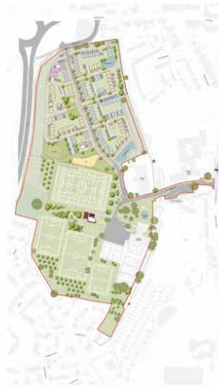
The proposed site layout

The Grange School closed in 2016 and most of the buildings were demolished in 2021. One was turned into a base for Majestics gym in 2023. Digitech Studio School and Warmley Park School are nearby.